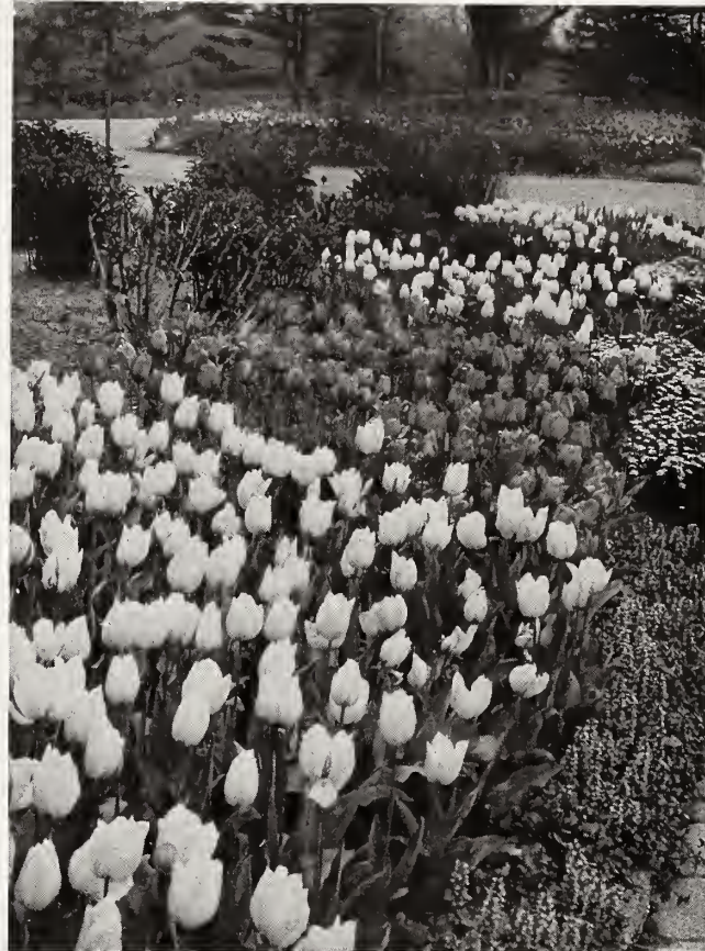
Beds of Single Tulips

Queen of the Netherlands. B 13. Beautiful pale rose flower of large size. One of the finest pale pink Tulips for bedding. Good for forcing, retaining its delicate color well if not forced too hard..... 70 5 00 48 00